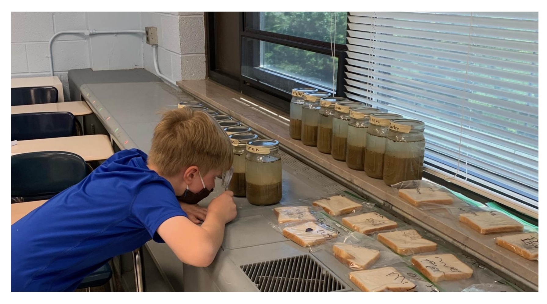
Studying Pond Scum and Mold